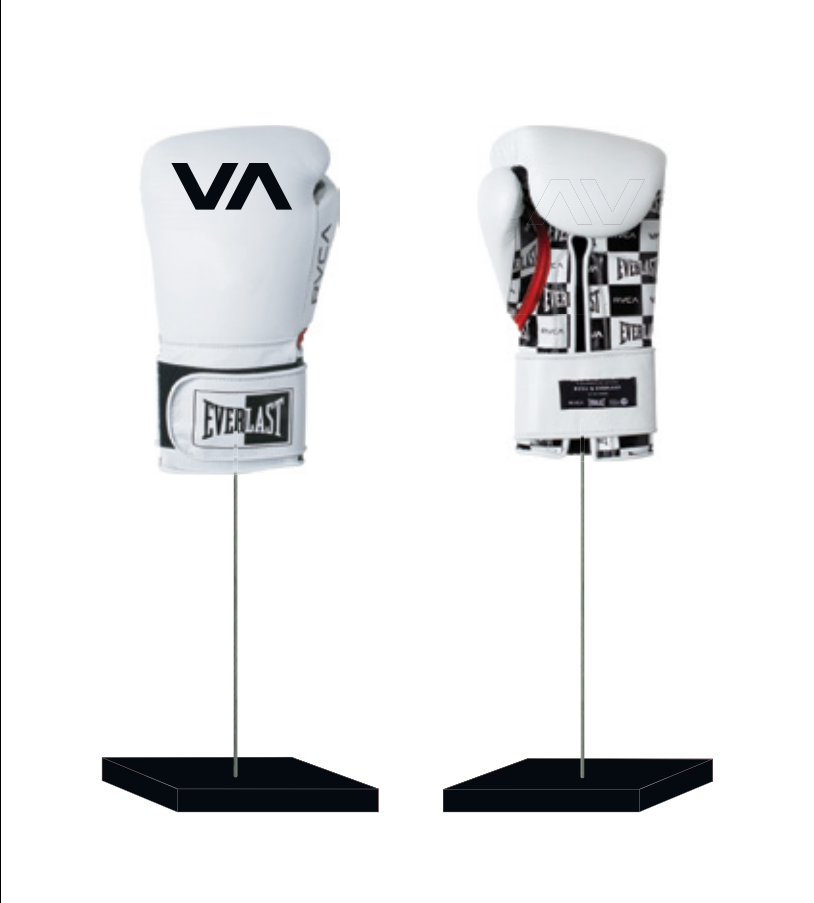
211 EVERLAST POP E WOOD AND FOAMCORE