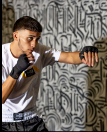
Built to last in the ring. @everlast || #BalanceOfOpposites #RVCA #Everlast

MONDAY - 2.15.21 15 SEC BOXING FOCUS EDIT