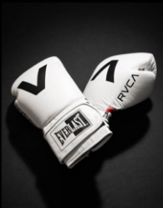
HIGHLIGHTING GLOVES CAROUSEL