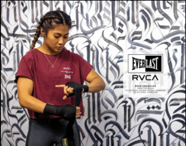
211 EVERLAST POP D 8.5X11 MAGNET