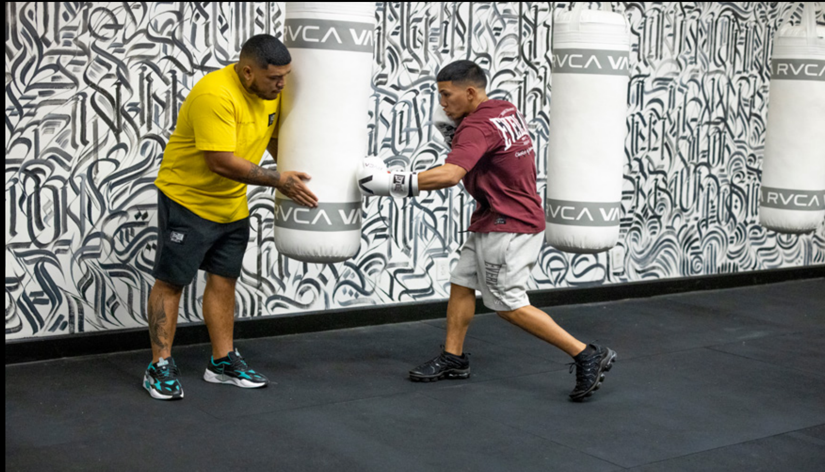
The RVCA x Everlast video will live on our YouTube Channel (25k Subscribers)