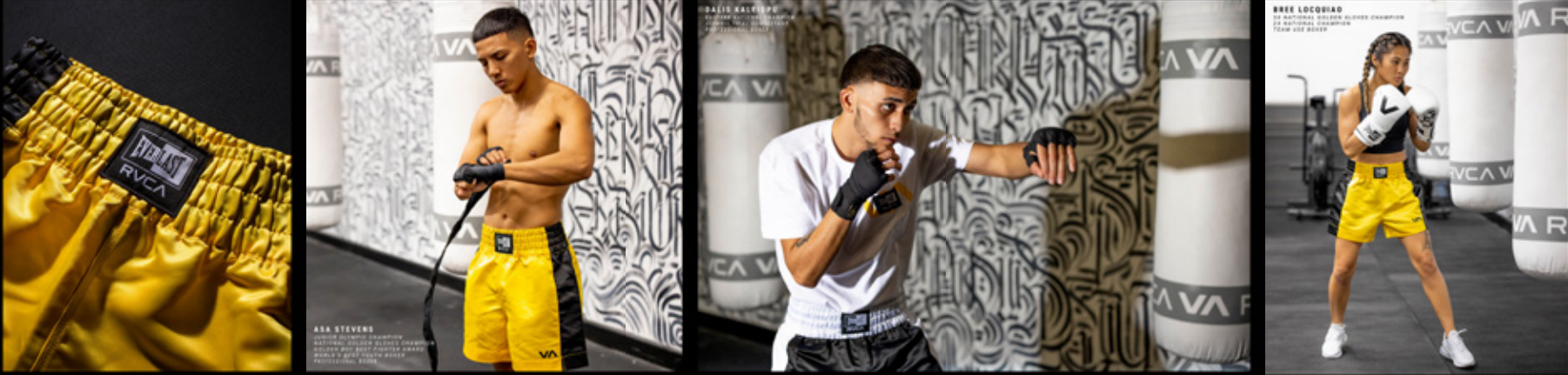
A collaboration fit for champions. || Link in Bio || #BalanceOfOpposites #RVCA #Everlast

THURSDAY - 2.18.21 >> HIGHLIGHTING BOXING SHORTS