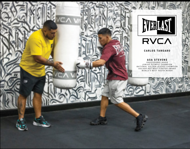
211 EVERLAST POP C 8.5X11 MAGNET