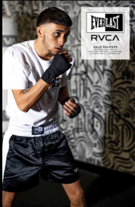
211 EVERLAST POP A 11X17 MAGNET