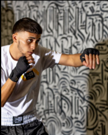
15 SECOND AV BOXING FOCUS