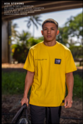
CAROUSEL OF LIFESTYLE & PRODUCT FLAT LAYS