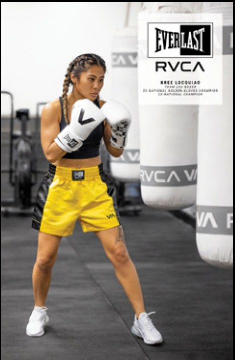
211 EVERLAST POP B 11X17 MAGNET