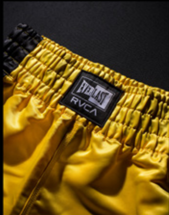
HIGHLIGHTING BOXING SHORTS - CAROUSEL